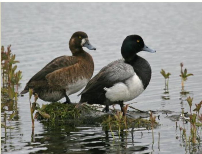
Feeding and resting habitat for migrating scaup is of international importance.

Avoid allocating credit for actions or sites that will depend on perpetual, on-going management to be successful. Focus on achieving sustainable results.