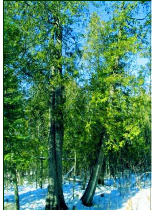
Preservation can be considered for portions of sites containing a significant northern white cedar component.

Allocation of credit for preservation under ENRV is not limited by land ownership or area of the state. However, MN Rule 8420.0526, Subp. 9 and BWSR Preservation Guidance should be consulted for additional details.