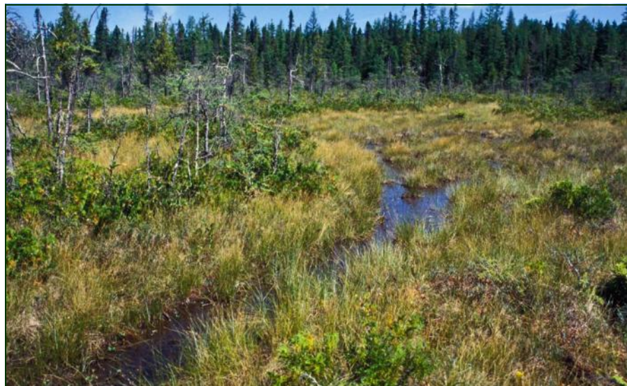
Projects that restore and protect northern white cedar are excellent candidates for ENRV.

Qualification for use of ENRV is somewhat rare as other actions eligible for credit are usually available and exceptional resources are not common.