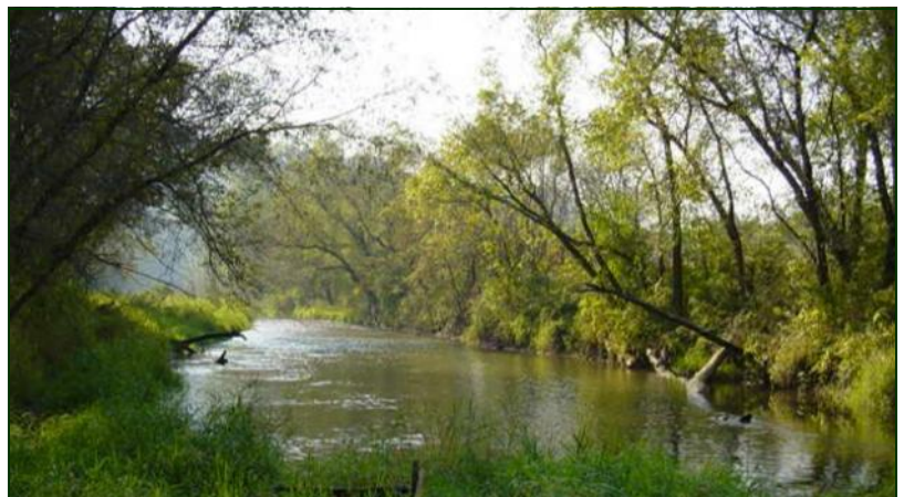
Restoration and protection of wetlands and upland buffer adjacent to trout streams can be considered for ENRV due to the exceptional benefits they provide.

The applicant must submit sufficient information to document the existence of an eligible resource and for the TEP to determine if the proposed project warrants the allocation of replacement credit. The use of ENRV is approved as part of a replacement or banking plan application in accordance with the standard WCA decision-making process.