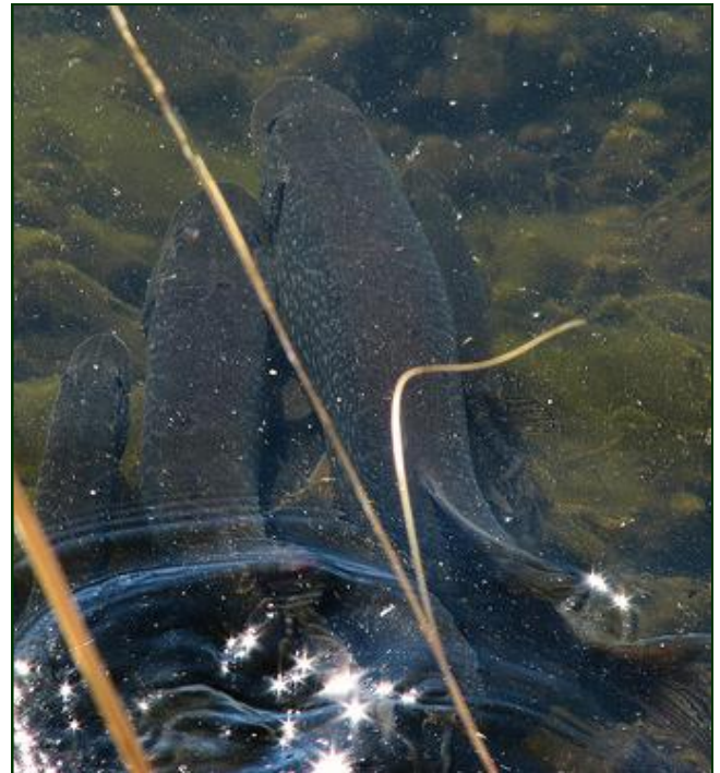
Projects that restore and protect spawning habitat for northern pike or other important species can be eligible for ENRV.

The U.S. Army Corps of Engineers is responsible for approving wetland mitigation credit under the federal Clean Water Act. To increase the likelihood that ENRV credit will be acceptable for both the state and federal programs, applicants are encouraged to consult with the Corps early in the process, before a full application is prepared and concurrent with TEP pre-application scoping.