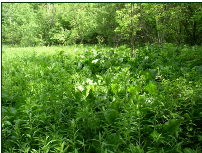
A decorah shale wetland may be considered exceptional in southern MN.

See the BWSR website for examples of exceptional resources and a list of approved ENRV projects.