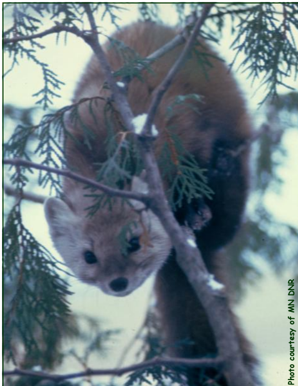
Pine marten rely on large tracts of contiguous wetland and upland habitat, including conifer swamps.